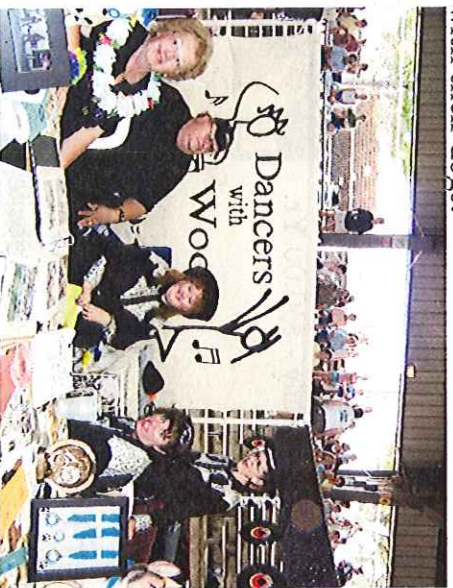
Stare Fair Booth

Freestyle demonstrations have become a favorite attraction for spectators due to the impressive display of teamwork that develops between the dogs and their handlers, but the greatest appeal for participants, as most club members will testify, is the fun they have with their dogs.